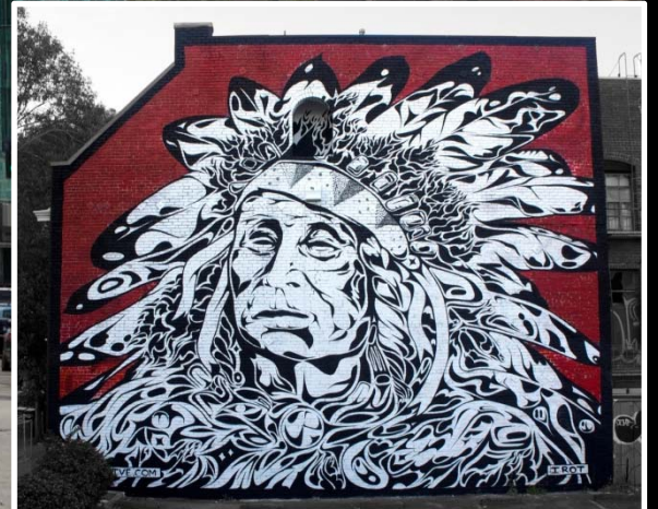
Oakland murals curated and installed by Athen B. Gallery